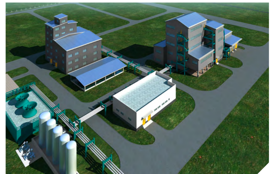
Shared experiences between our Saint Fons and Zhenjiang teams

You can thus provide higher value to your customers by delivering the "Proudly made in China Rhovanil®" with its centennial industrial experience.